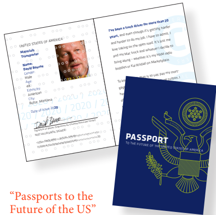
“Passports to the Future of the US” depicting the people working in a prototypical industrial recycling system and the challenges in their work life.

working on this project. And thus began a remarkable partnership with the RCSD. We developed a workshop for the Division, designed to reframe their work from enforcement to advocacy. In a series of online social network sites, participants joined dialogues over key topics in sustainable materials management. To reinforce the changing frameworks, all participants were given a new passport (to the future of the United States) in which they assumed the role of a key actor in a closed-loop industrial recycling system. From that new perspective, people learned about the details of each other’s jobs and roles throughout the system.